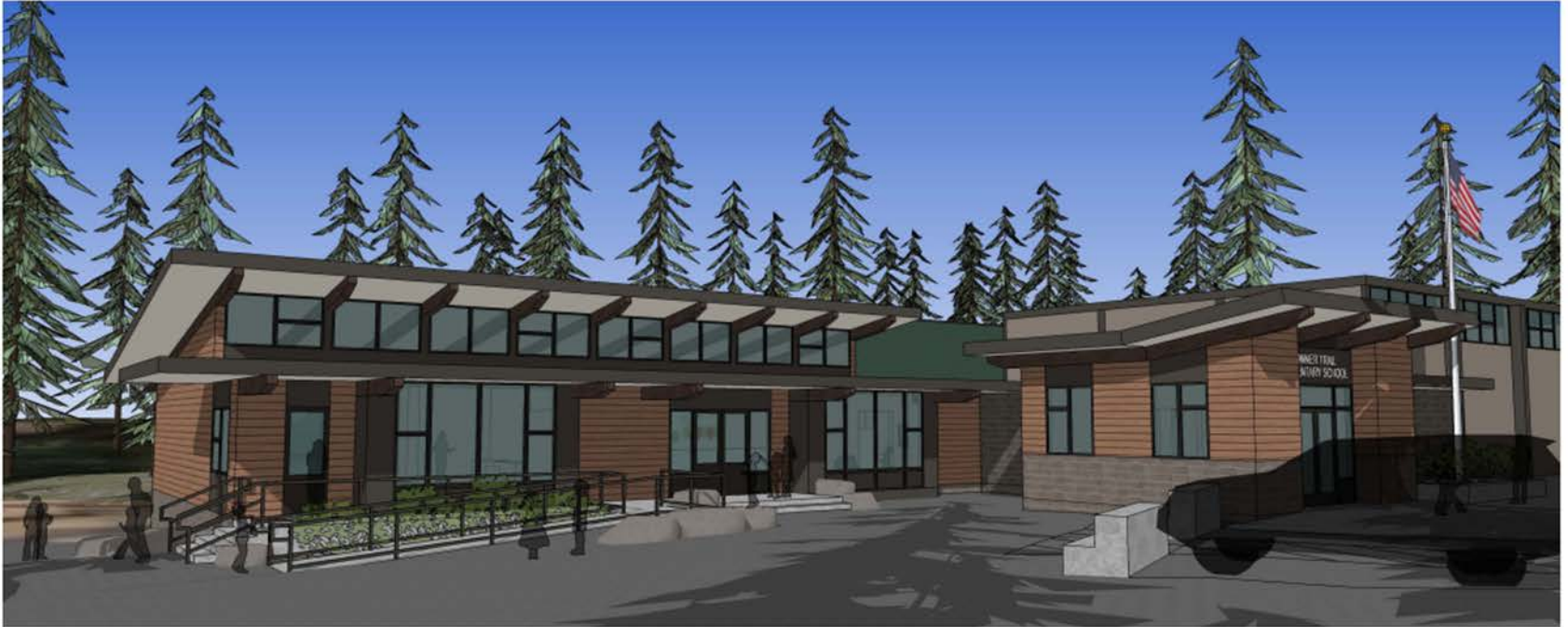
CLASSROOM WING SOUTH

DONNER TRAIL ELEMENTARY SCHOOL MASSING CONCEPT FEBRUARY 1, 2016