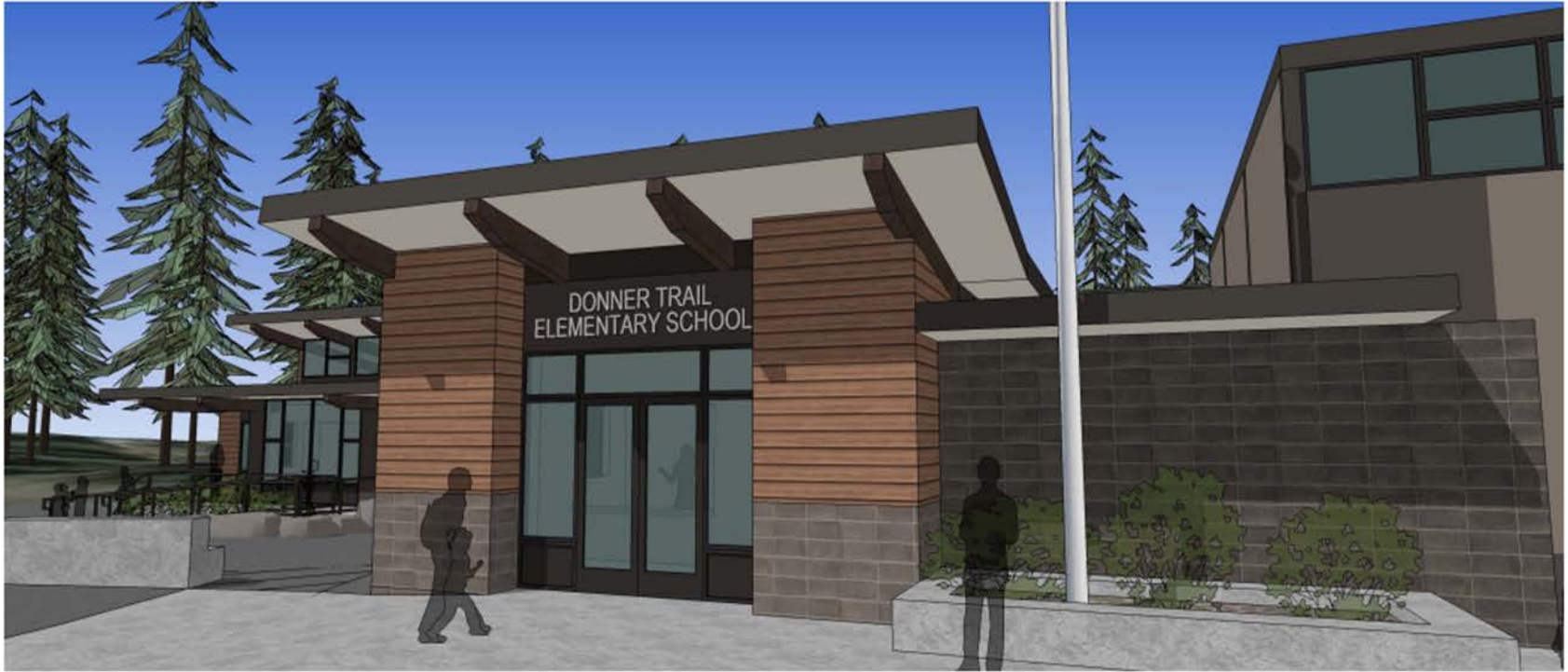
SOUTH PERSPECTIVE: ENTRY

DONNER TRAIL ELEMENTARY SCHOOL MASSING CONCEPT FEBRUARY 1, 2016